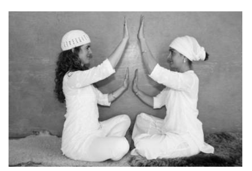
Time: 22 Minutes

Fix your eyes unblinking toward your partner's eyes. Penetrate through the eyes to the light of the soul. See the unlimited space of that person and see them exactly as they are, with you, joined in this common space of energy and awareness.